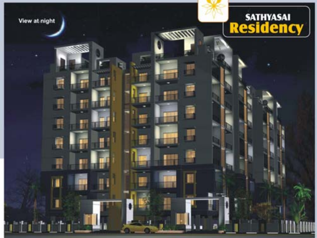
View at night